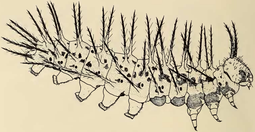
FIG. 2. Fifth instar larva of Podotricha telesiphe , drawn from a specimen preserved in 70% ethanol, approximately 1 month after it was collected. [Note that there is a discrepancy in the length of the head scoli between the written description (accurate) and the figure, which is due to the three-dimensional structure of the specimen.]

two-thirds the length of dorsal scoli; anal cap white. Duration of third instar 7–9 days ( n = 5 ). Fourth instar . Same as third instar, except yellow areas more strongly developed on dorsum and sides of body; lateral scoli white with black tips. Duration of fourth instar 8–9 days ( n = 5 ). Fifth instar (Fig. 2). Head creamy white; head scoli and setae black, approximately 1.5 times the length of head; dark ocular area; body white with numerous black spots, large yellow spots at base of dorsal scoli, body with well-developed yellow lateral line; basal one-fourth of dorsal body scoli yellow, distal three-fourths black, dorsal scoli approximately 1.3 times the length of head; subdorsal scoli black, white or yellow at base, approximately three-fourths the length of dorsal scoli; lateral scoli generally black, approximately two-thirds the length of dorsal scoli; anal cap white; ventral side of thoracic segments, A1–2, and A7–9 black. Two or three days before pupation the white areas of the body become faint blue. Duration of fifth instar 9–10 days ( n = 3 ).